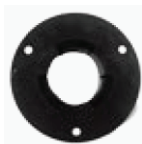
Cylindrical covert bracket