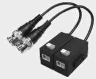
PFM800-E Passive HD-over-Coax Balun