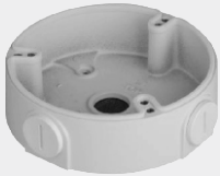
PFA136 Junction Box