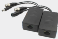
PFM801-4MP Passive HD-over-Coax Balun with Power