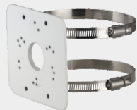
PFA152-E Pole Mount