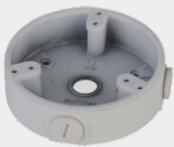
PFA137 Junction Box