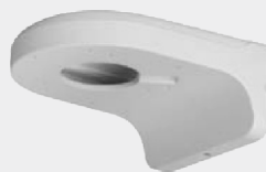
PFB203W Wall Mount