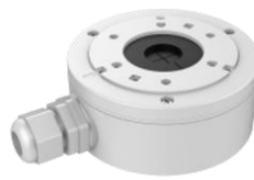
LTB345 Junction Box